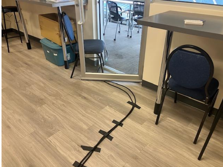
Comm Centre Feedline thru doorway

The feedline routing currently used is sub-optimal, a potential solution has been proposed to Manitoba Marathon (MM) Executive Director.