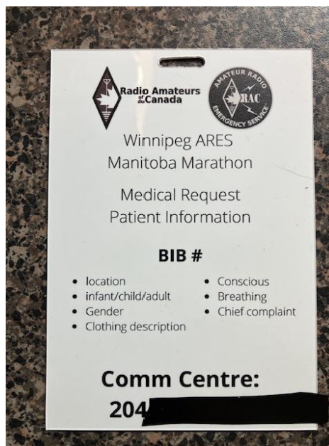
2025 Amateur Radio Tag

The Amateur Radio Marathon tags were not ready at supply pick-up date again , alternate tags were brought to the 16 JUN briefing – the lanyards did not have a safety-break.